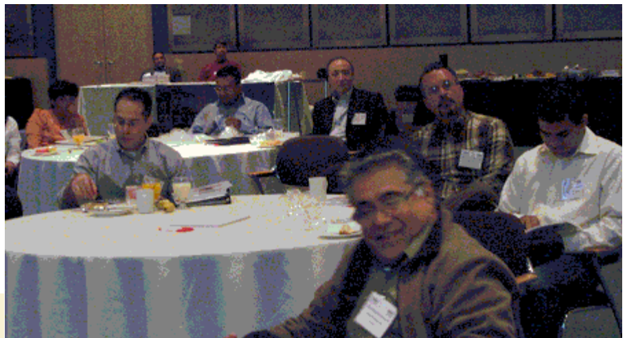
Some of our attendees...

Some of our members have requested the Chapter to proctor the online exam for the COBIT foundation course. The chapter is looking for more participants for this exam, so we can put together an examination session with a proctor. Please reach out to vicepresident@isaca-sv.org or conferencedirector@isaca-sv.org and submit your requests.